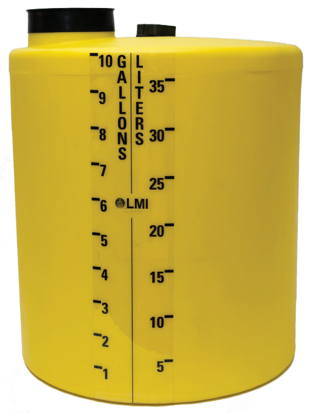
Model No. 27421 Tank Assembly (Pump must be ordered separately.) Shipping Weight: 7 lbs (3.2 kg)