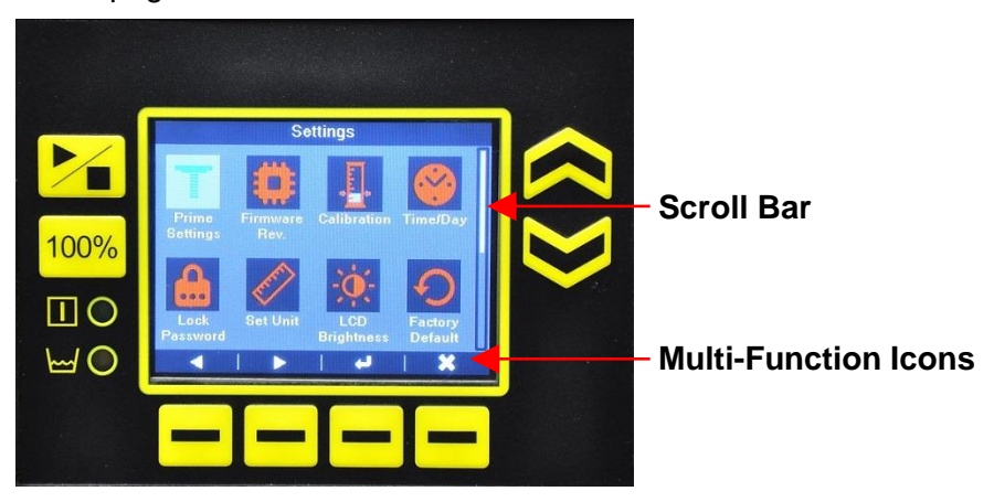
Figure 1: Display Navigation

Navigation through display screens is done using the Up , Down , and Multi-Function buttons. The settings screen is shown in the example below (Figure 1: Display Navigation). The scroll bar on the side of the display screen indicates there are more settings available on another page.