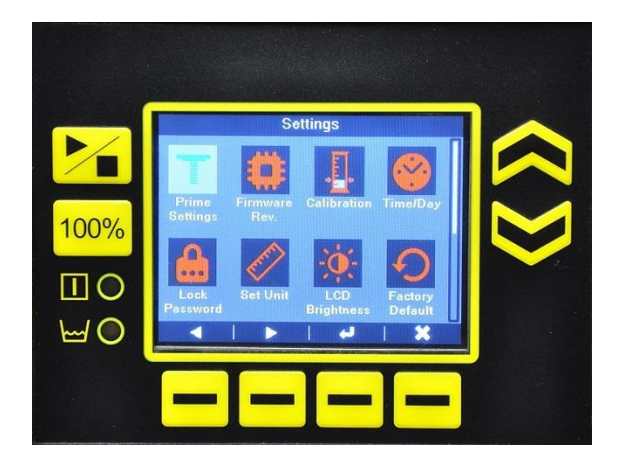
Figure 2: Settings

To access the settings screen (Figure 2) press Settings in the home screen. Navigate to the function desired and press Enter . Follow the prompts to enter new settings. New settings will need to be saved by pressing Save . Press Exit to return to the previous screen without saving.