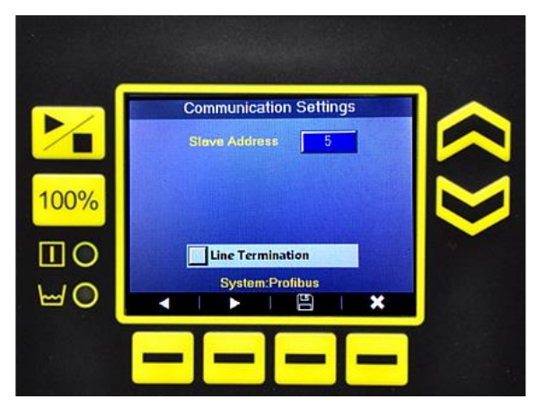
Figure 4: Communication Settings