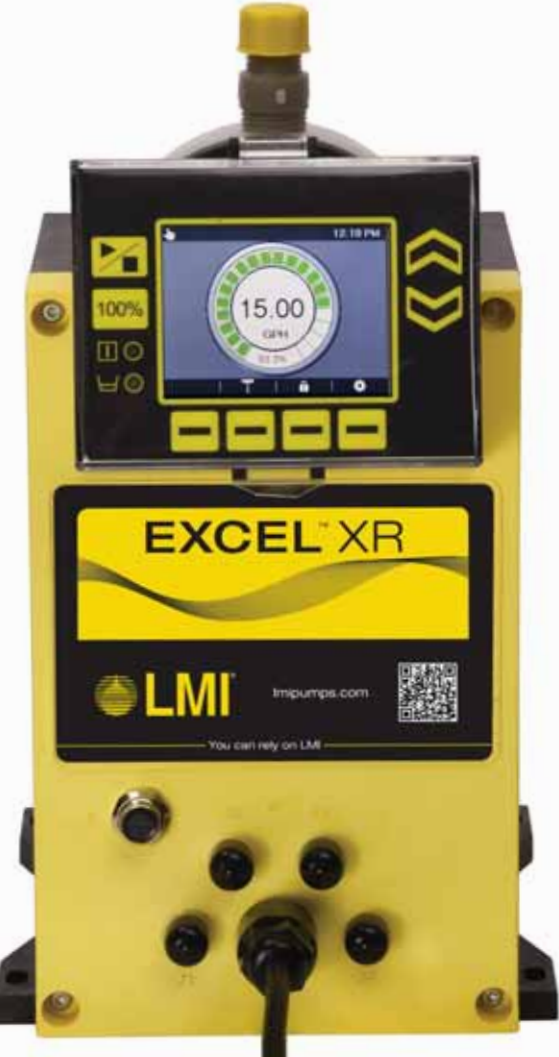
Pictured: Communications model

Selecting the right pump just got easier. No complicated configurations are necessary to find the right pump. With the Manual, Enhanced, and Communications models offered, simply pick the features that fit your needs (see page 6 for a complete list). Our models offer a wide range of functionality including backlit display, multilanguage, and 2-way communication to name only a few.