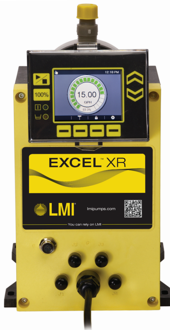
Pictured: Communications model

Selecting the right pump just got easier. No complicated configurations are necessary to find the right pump. With the Manual, Enhanced, and Communications models offered, simply pick the features that fit your needs (see page 6 for a complete list). Our models offer a wide range of functionality including backlit display, multilanguage, and 2-way communication to name only a few.