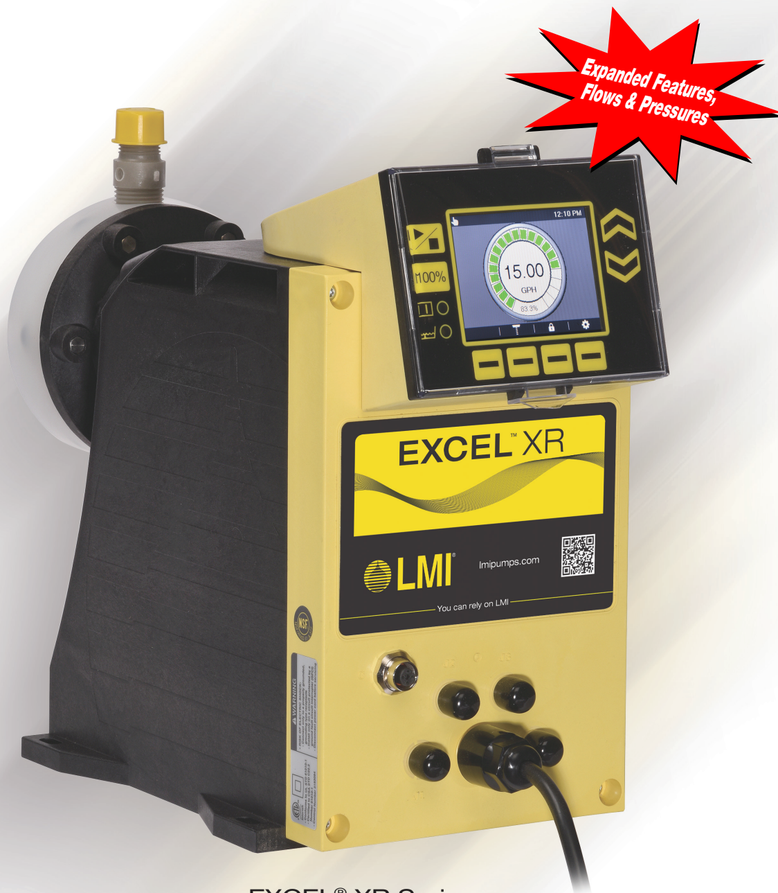
EXCEL ® XR Series